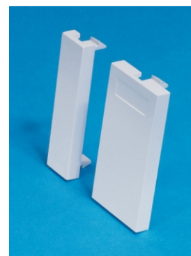
0.5 and 1 position blanks

Austin Taylor Communications Ltd Bethesda, Gwynedd, LL57 3BX, UK